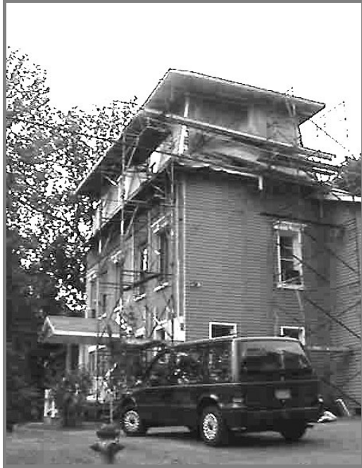
Among the items which can be reviewed by a local board is the materials used in the alteration of an historic property.

Standards for alterations and rehabilitation of historic structures are often borrowed from the United States Secretary of the Interior's Standards for Rehabilitation of Historic Properties. 22 Other sources of information on standards for use by municipalities are the Preservation League of New York State, county and regional planning agencies,