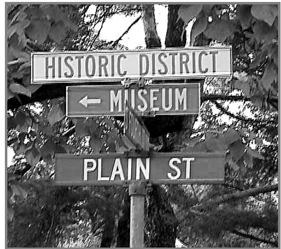
Signage provided by the Village of Lewiston.

On the other hand, where the City of Schenectady Historic District Commission required several measures, including planting 38 arborvitae trees eight feet in height in order to screen a proposed large above-ground swimming pool in an historic zoning district, the requirements were upheld by the Appellate Division. 15