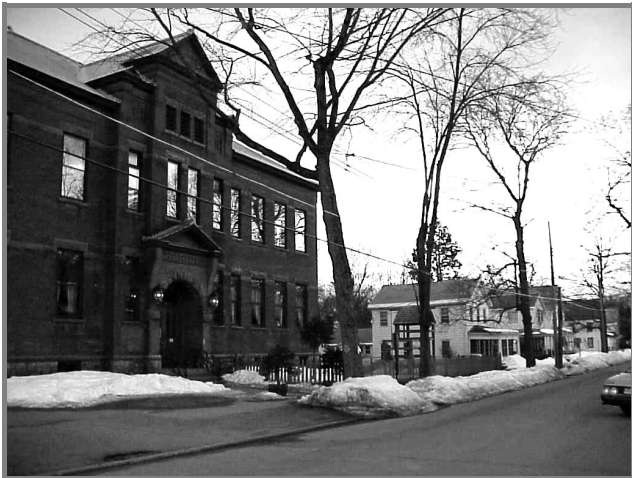
A former public school has been rehabilitated for use as a private school in the City of Saratoga Springs.

ordinance prohibited educational uses from locating in its “Single Family Historic District,” which encompassed the “General Electric Realty Plot,” a distinctive nine-block area of 120 homes developed at the turn of the 20th Century and listed on the National Register of Historic Places. The Court held that because of the competing public policy interests in education, such uses should not be foreclosed from locating in a residential zoning district, even a historic one. The Court further held that there must be a case-by-case deliberative process in which “proposed educational uses must be weighed against the interest in historical