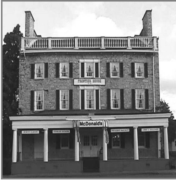
The owner of this building in the Town of Lewiston converted it into a fast food restaurant.

Listing of a property or area on the National and State Registers by itself does not limit the private uses of the property. Owners of property eligible to be listed are sometimes opposed to listing, because they think it automatically regulates what