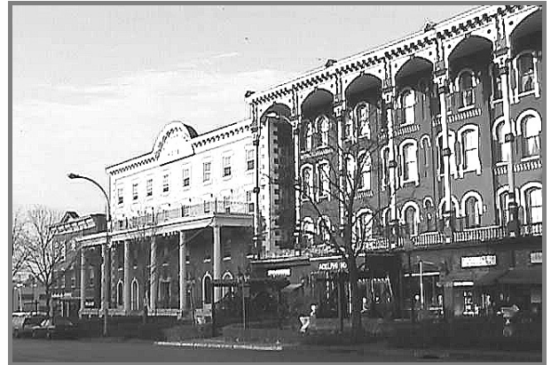
A view of Broadway in Saratoga Springs, New York.

districts, separate historic preservation laws authorized by General Municipal Law § 96-a and Article 5-K are typically used to protect individual