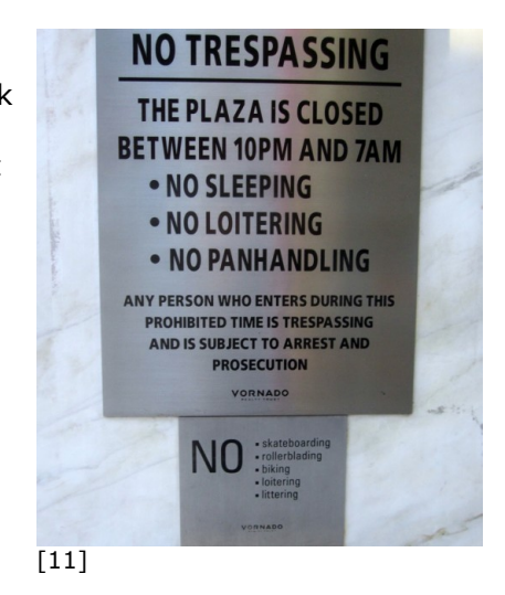
Rules of Conduct signs at Penn Plaza

The POPS at 60 Wall Street, on the ground floor of the Deutsche Bank building, is a vast, postmodern, vaguely orientalist confection designed by Kevin Roche, complete with palm trees and originally a water feature along the western wall. After the evacuation of Zuccotti Park, the space played host to "working groups" of OWS protesters who offered training and workshops in subjects like "Nonviolent Communication and Compassionate Communication."