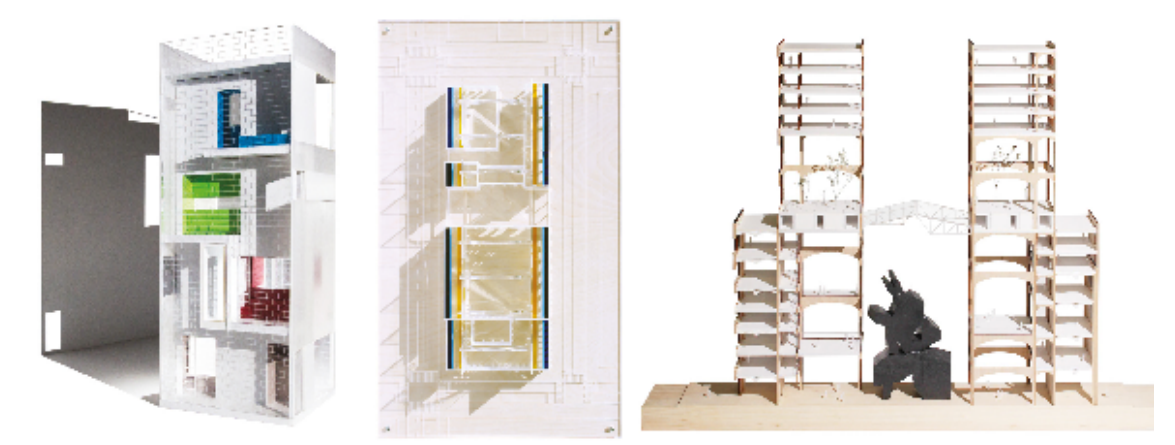
Model Studies for Artists' Housing, Andrew Grant, GSAPP Fall 2018

The studio will examine the relationship between the creation of architecture and the creation of an artistic community. We will interrogate the meaning of an intentional community through precedent studies, and we will scrutinize the gap that is invariably formed between the intentions of the architect and the unscripted act of living. In doing so we will develop concepts and tools that can be deployed to design spaces that can allow individuals and communities to flourish on their own terms, and accommodate collective and individual needs through a gradient of public to private space.