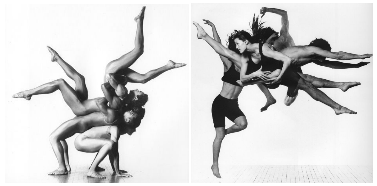
Lois Greenfield, Breaking Bounds, 1992

TEMPORALITY — Projects will engage time, duration and the cognitive difference between experience and reflection—identifying misalignments between the physics of palpable spatial and material presence and how we choose to remember, establish the value of absence, and commune with strangers. Innovative models of civic-sacred space and new modalities of remembrance will question the need for permanent repositories and epitaphs in the urban landscape.