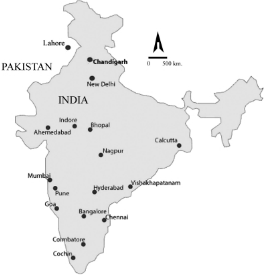
Figure 1. Location of Chandigarh.

of a single author, is it not better to see these plans as representing contestations, negotiations and compromises of imaginations? Calling the grand claim of Haussmann into question, David van Zanten has asked what share of credit should go to him [3]? The same question can be raised about Le Corbusier's celebrated plan for Chandigarh (Figs 1 and 2).