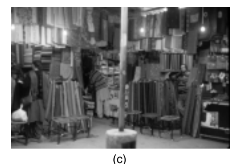
Figure 5. Familiarizing space: (a) market places provided by the authorities compared with (b, c) those created by the vendors.

Yet, the comparatively low level of activity in Chandigarh's road sides and the commercial sector speaks volumes of the impact this particularly unfamiliar place has on the daily practices of its citizens (see Fig. 5).