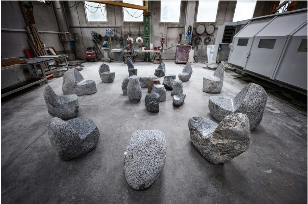
Max Lamb, Seating

Through critical inquiry, design research, and playful experimentation, students will gain experience in drawings: site plan, architectural plans, and details, material specifications, detail sections, and making material models, patterns for a work jacket, and drawing scale figures. An emphasis will be placed on working with recycled materials and hybrid models.