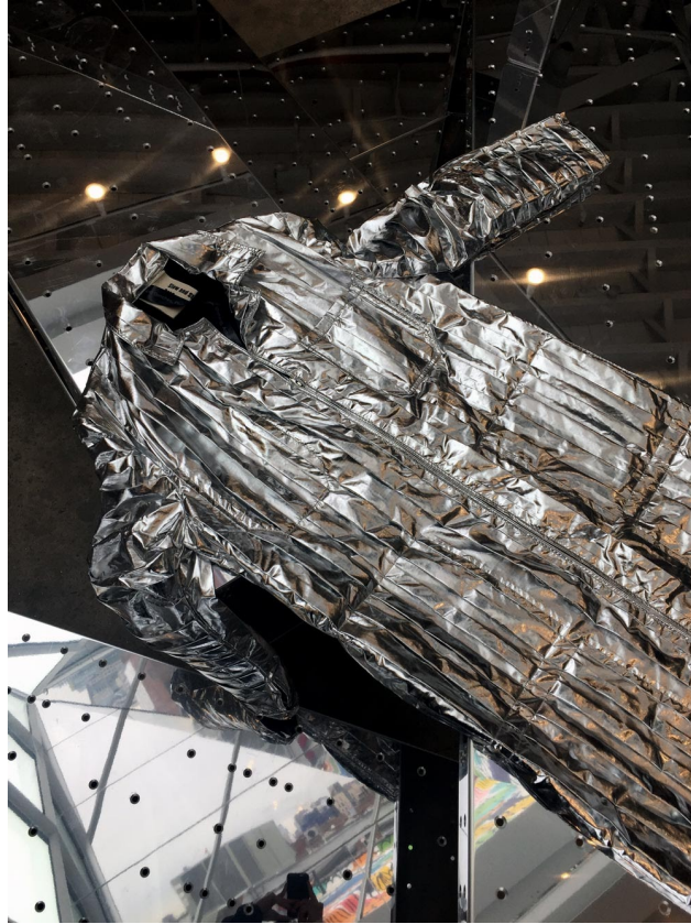
MOS with Slow and Steady Wins the Race